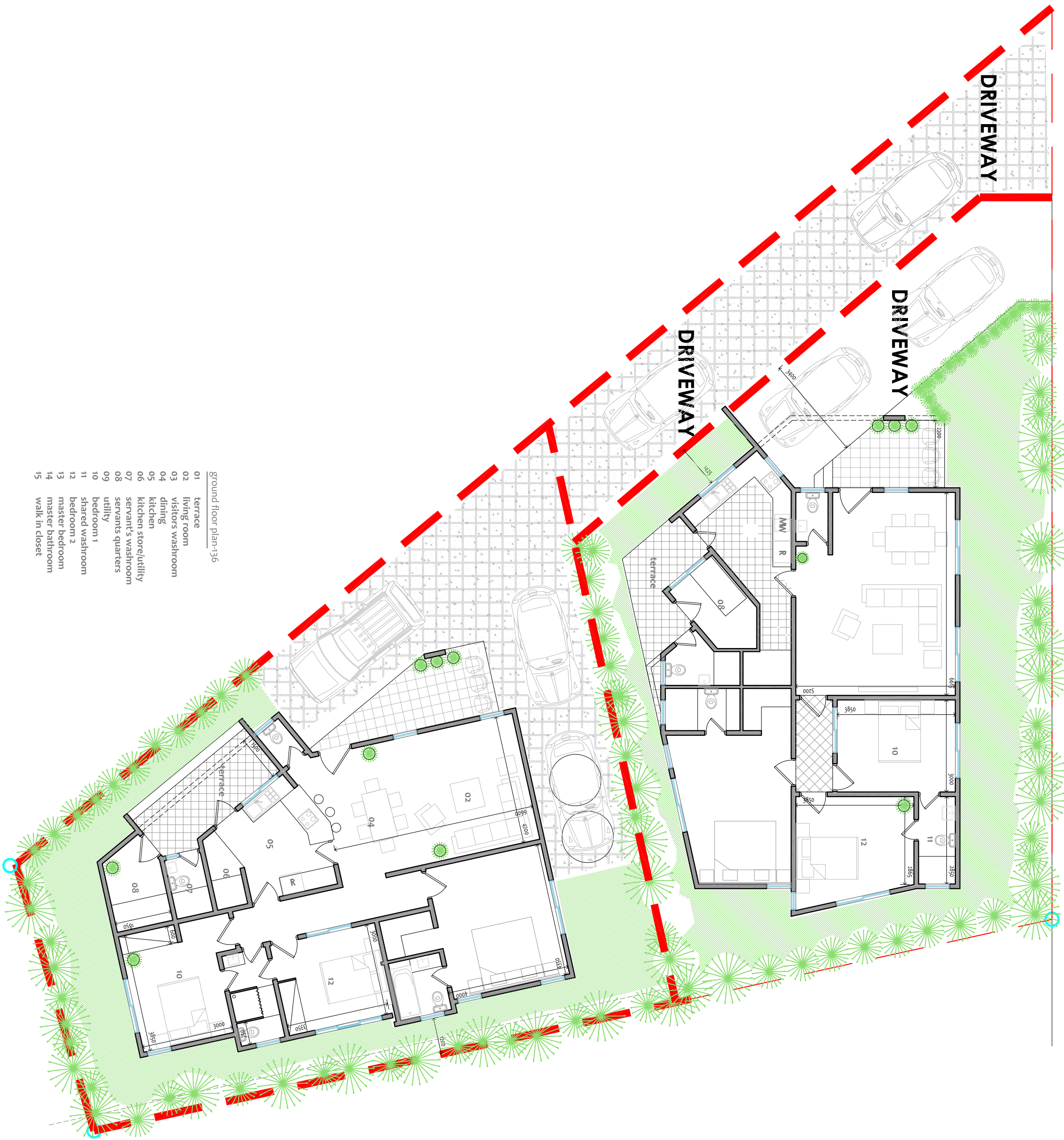
ground floor plan-136